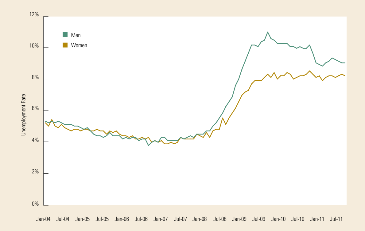
Exhibit 3: Employment Gap by Gender

Over the last decade, the likelihood of a young adult earning a college degree has stagnated in the United States, for the first time.