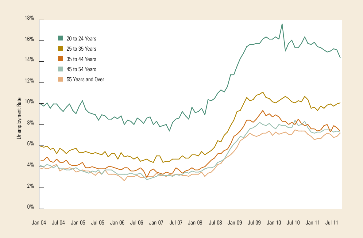
Exhibit 4: Employment Gap by Age